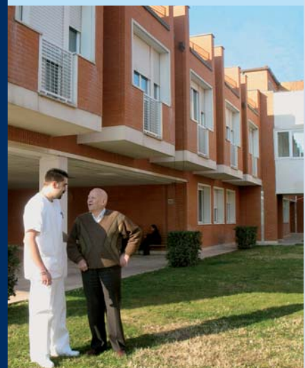
CESA: medical assistance and research for the elderly in memory of Alberto Sordi