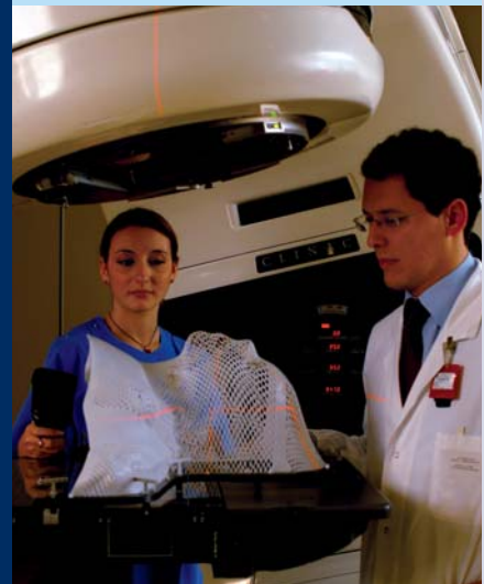
Out-Patients' Clinic and Radiotherapy Centre: the facilities in Via Longoni